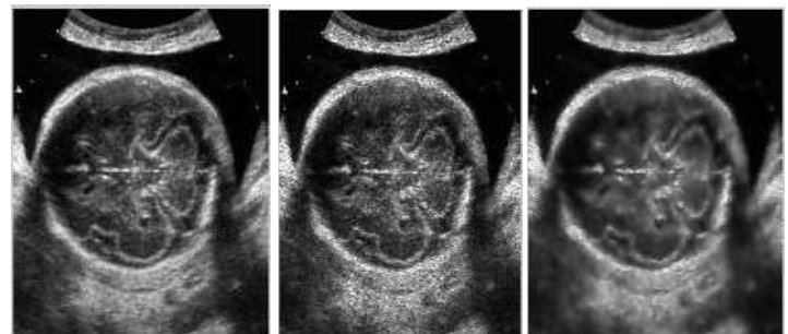
(a)CRANIAL Image (b)Noisy Image (c)Denoised Image Figure 2 : Filtering through wiener filter with speckle variance 0.01.

The original noise free CRANIAL image, noisy image with speckle variance 0.01 and the denoised image by wiener filter are shown in Figure 2